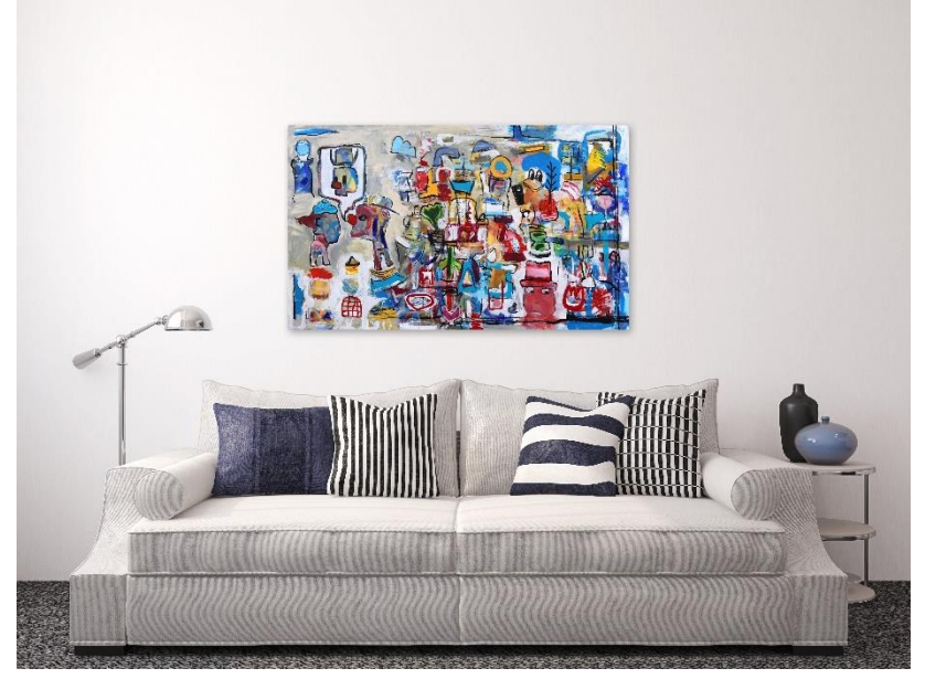
Artspace Warehouse is one of the world's leading galleries for savvy contemporary art collectors . With galleries in Zurich and Los Angeles, Artspace Warehouse specializes in guilt-free international urban, figurative, pop, graffiti and abstract art.